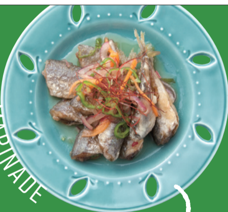
Nanban Style Sardines (marinated with red pepper and onions)

Canned sardines are rich in EPA and DHA, which are expected to improve blood viscosity and lower blood pressure. Red peppers, which also lower blood pressure, provide a spiciness and flavor that makes this dish delicious without the need for much salt. Additionally, vinegar has been shown to lower blood pressure.