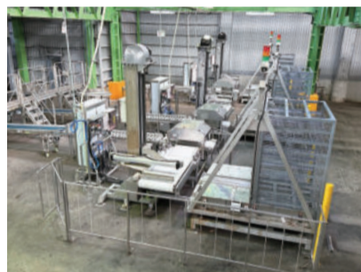
Automated Production Line

A variety of fishing boats from all over Japan put into port here. This is Japan's largest fishing port by volume. Around 200 species of fish and shellfish are brought ashore.