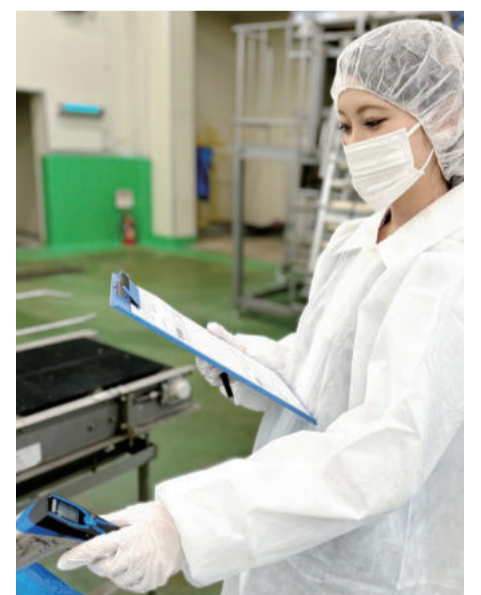
Quality and hygiene control inspection