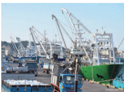
Japan's No. 1 Fishing Port - Choshi Fishing Port

A variety of fishing boats from all over Japan put into port here. This is Japan's largest fishing port by volume. Around 200 species of fish and shellfish are brought ashore.